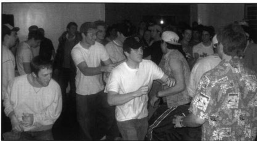
2004 Winter Dance Party